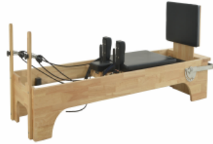
HOS-L001 Core Training Bed Weight:135kg Size(L*W*H) 2340*700*660mm