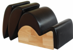
HOS-L008 Pilates Spine Corrector Combo Weight:14kg Size(L*W*H) 750*530*500mm