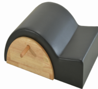
HOS-L005 Pilates Spine Corrector Weight:10kg Size(L*W*H) 750*530*500mm