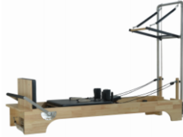
HOS-L006 Pilates Reformer Bed Weight:186kg Size(L*W*H) 2340*700*2000mm