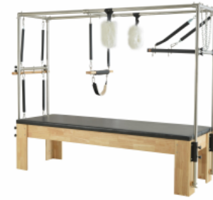
HOS-L002 Cadillac Bed Weight:170kg Size(L*W*H) 2520*770*2030mm