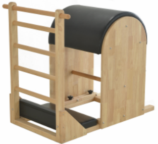
HOS-L004 Wooden Ladder Bucket Weight:55kg Size(L*W*H) 1150*770*1000mm