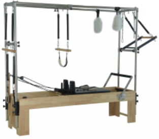
HOS-L007 Pilates elevated bed Weight:196kg Size(L*W*H) 2340*700*2000mm