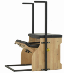
HOS-L003 Pilates Chair Weight:35kg Size(L*W*H) 800*540*1130mm