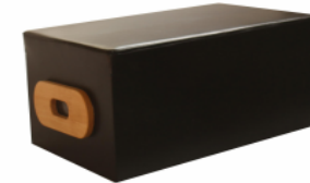
HOS-L009 Pilates Long Box Weight:8kg Size(L*W*H) 720*430*270mm